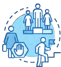
Restrictive gender norms