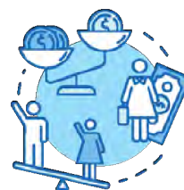
Labour market Inequalities