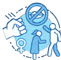
Gender-based violence and harassment